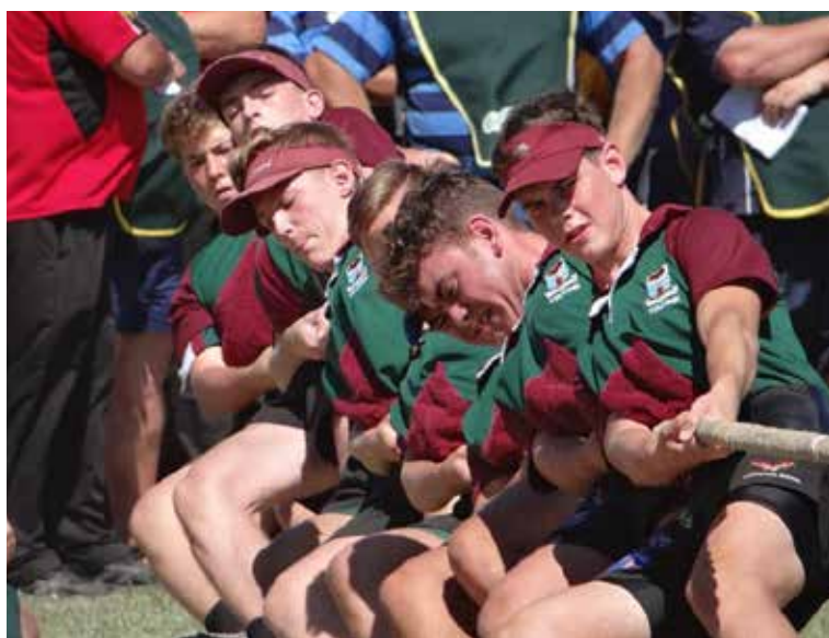
Above: 560 kg Juniors from Strand High School participating at the SA Junior Championships held in March 2020 just before the first Covid lockdown.