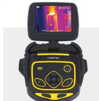
The XC300 can be flexibly controlled via buttons or touchscreen and its illuminated keypad facilitates the operation in dark surroundings.