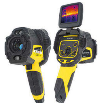
The front of this robust camera comes equipped with real image camera, photo lamp, laser pointer and distance meter. As an alternative to the standard lens you may also use various interchangeable lenses.