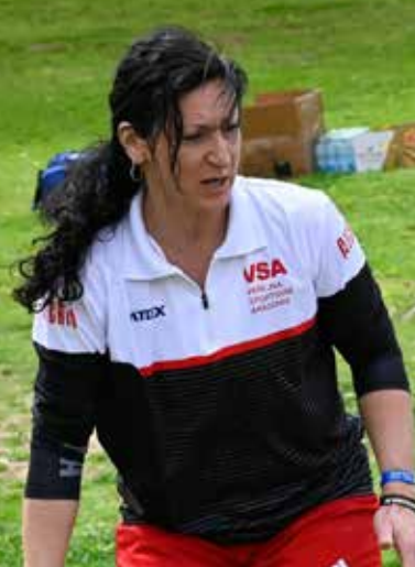
More pics from the THE AYELET International Games