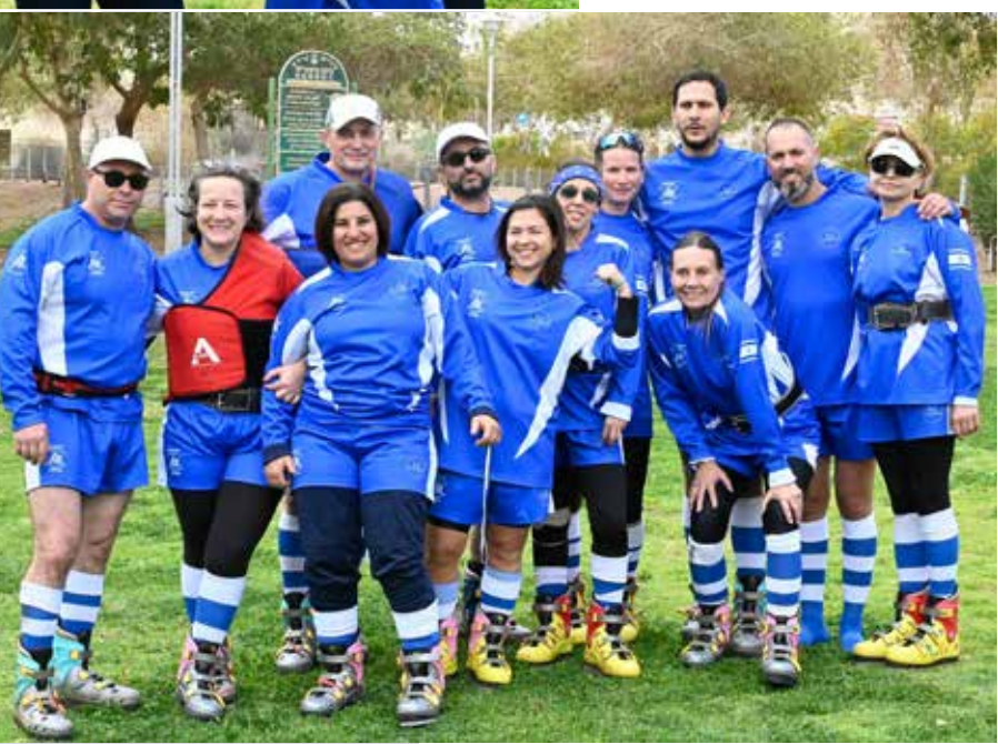
Israel NT hosted the Czech national team - Men, Women & Mixed for a 2 day training and competition camp during the Ayelet International Games in the city of Eilat.