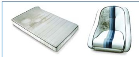
After Sky Cleaner application.

Here are the results attained after the application of a specific product.