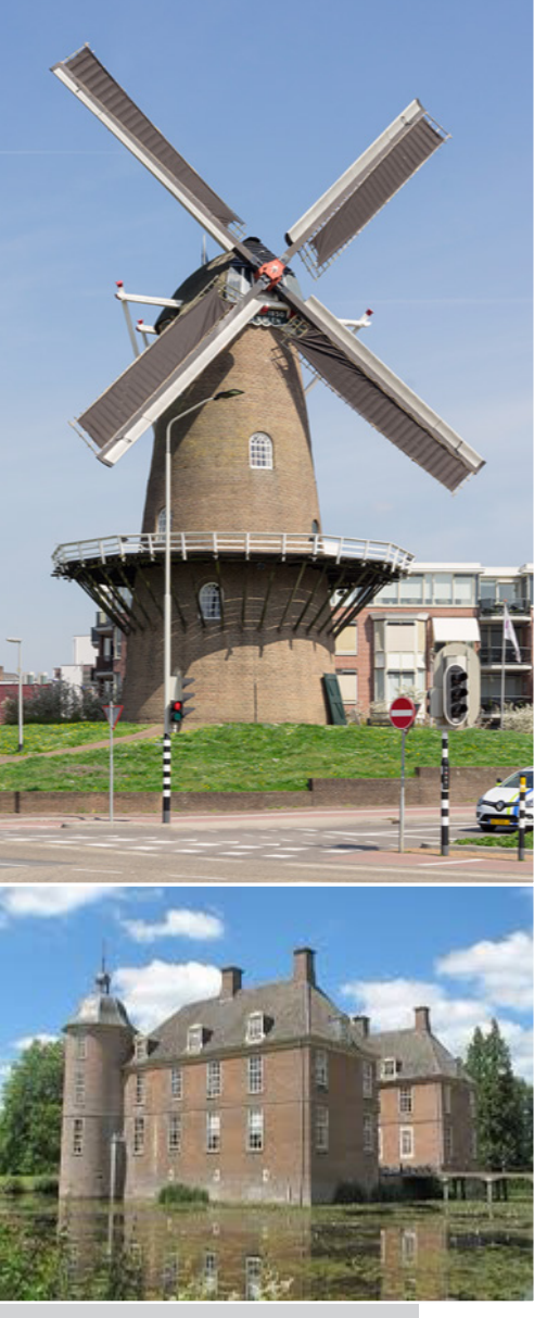
De Achterhoek is a beautiful area.