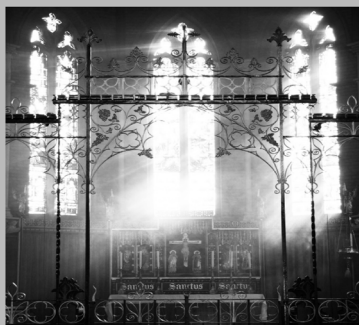
St Luke's Church is on the corner of Burton Road and Gibbon Road, Kingston upon Thames, Surrey, KT2 6AB

Experience this traditional service of rare and mystical beauty in which the Word is illuminated through choral music and chant, in the beautiful atmosphere of St Luke's Church