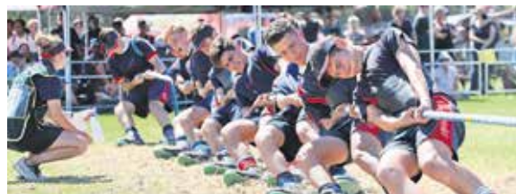
The young athletes put their best foot forward to deliver great entertainment.

"Boys and girls of all cultures and backgrounds were to be seen at this sports meeting, a wonderful occasion for South Africans to be proud of – one for nation building." Marais mentioned how difficult sponsorship was to source from government, even though it cannot but invest in the athletes of tomorrow who devote so much work and