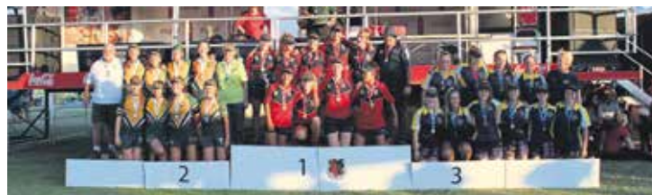
Swellendam High School took first prize in the 480 kg girls' category.

The South African Tug-of-War Federation would really like to thank the Worcester community, and particularly HTS Drosty, for their hospitality and involvement in the recent SA Junior Tug-of-War Championships. Furthermore, it expresses sincere thanks to the event's sponsors for their contribution to a very successful sports meet. And lastly, but by no means least, the federation thanks those who took part in it.