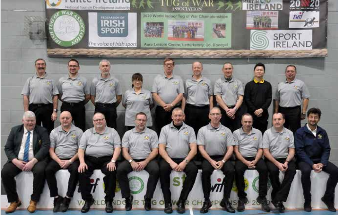
Judges/evaluators WC Indoor Letterkenny 2020