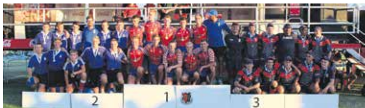
The winners of the u-19 560 kg boys' category showed their mettle.

"A Mexican wave reverberated right round the stadium, from participants and spectators, a moment that gave one gooseflesh. It also gave one the impression that unity was truly the order of the day among all involved."