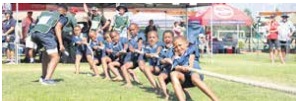
South Africa is one of the few countries that still present "barefoot" tug-of-war.

categories; its 480 kg u-19 girls walked from the field the team champions and will represent their country internationally. "The passion I've observed among the learners for the sport tug-of-war is truly great," Theron said, "and it builds a fantastic spirit among them. If they achieve the sort of success they achieved this weekend, then the blood, sweat and tears spent were worthwhile."