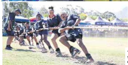
The passion can clearly be seen in the mixed event. The coaches were close to encourage their teams.