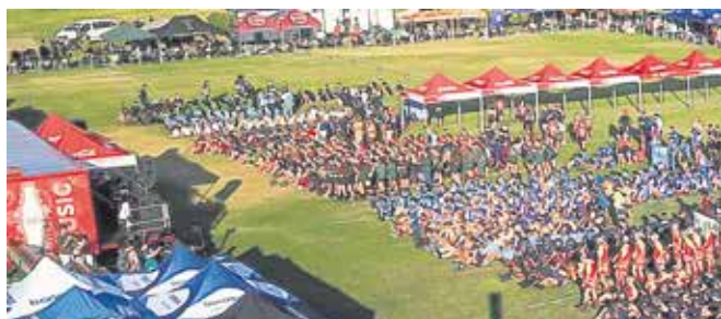
The South African junior tug of war championships were held at HTS Drosty on Friday 13 and Saturday 14 March. Right: the women are tugging hard for a victory.