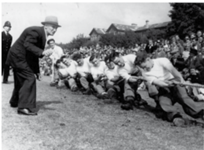
Eccles Caravans - 1950