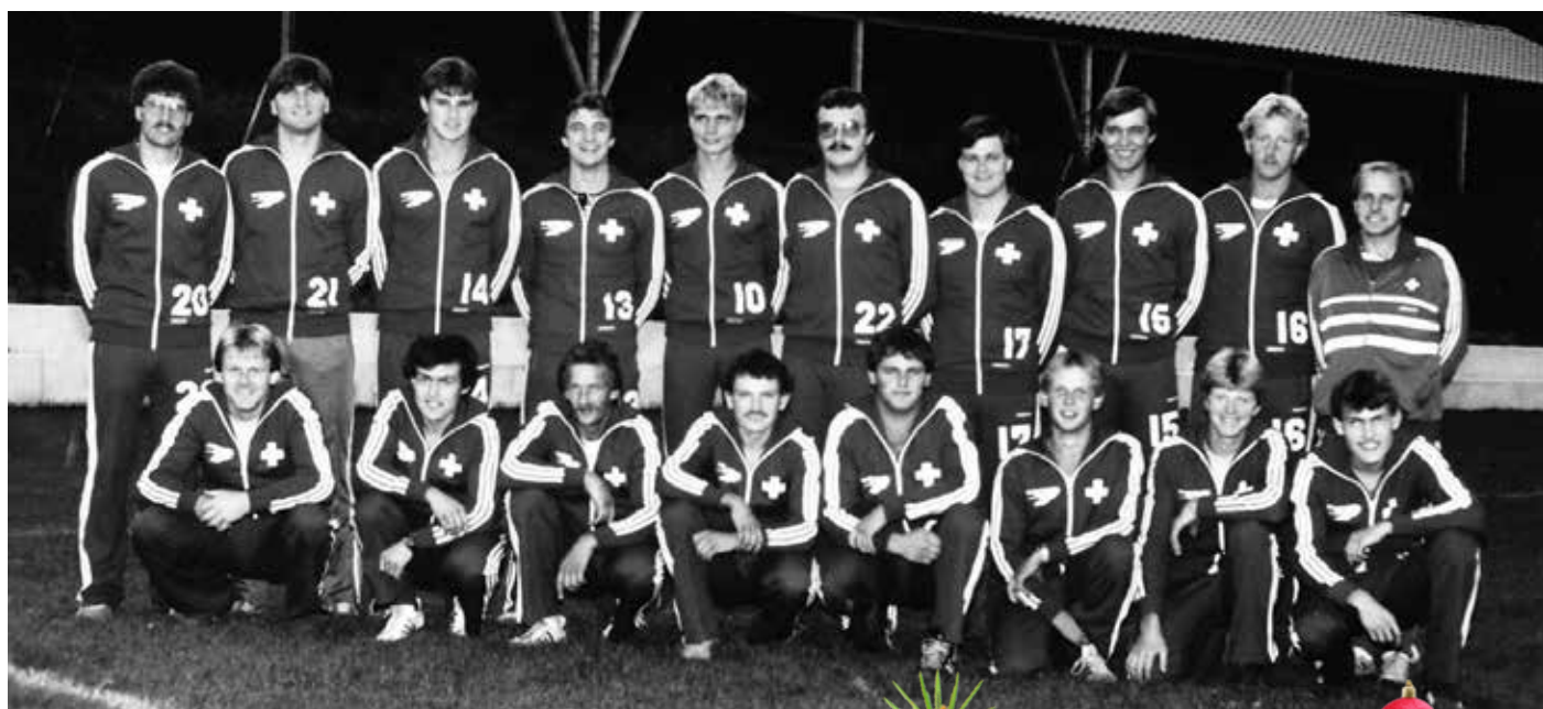
Sins pullers in 1985 in front of the training facility in Sins.