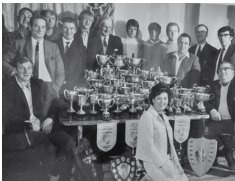
Felton Eccles Team with their cups and the landlady of the George and Dragon Pub, their HQ and where the bar was named 'The Trophy Bar'. (Pic taken late 60's)