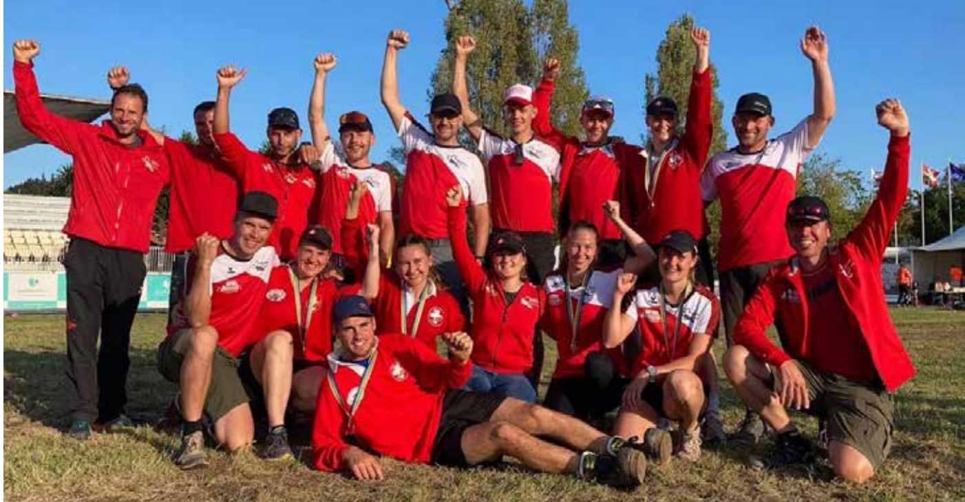
These rope pullers from Sins represented Sins at the World Championships in the Basque Country.

Since its foundation, athletes from Sins were able to participate in most international tournaments as well as European and World Championships. A highlight was certainly the 1985 World Championships in Stans, when Sins won two gold medals and one silver. Six years later, again at the European Championships in Stans, the Sins 640 kg team won the Open title. In 2001 and 2003 the Sins athletes returned with the club world championship title in the men's 680 kg category. At the home World Championships 2012 in Appenzell, the men's U23 won the Open gold medal for the first time. With three GENSB victories in the last ten years, the youth team has also been very successful. After many years of trying the Sins men finally won the 560 kg category in Castlebar. This year, Sins was also represented at the World Championships in the Basque Country. Under special conditions, the women's 500 kg team won the bronze medal and the men's 560 kg team the silver medal.