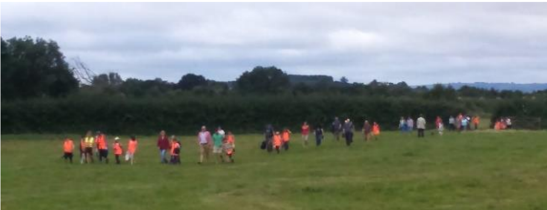
MAYA on the march