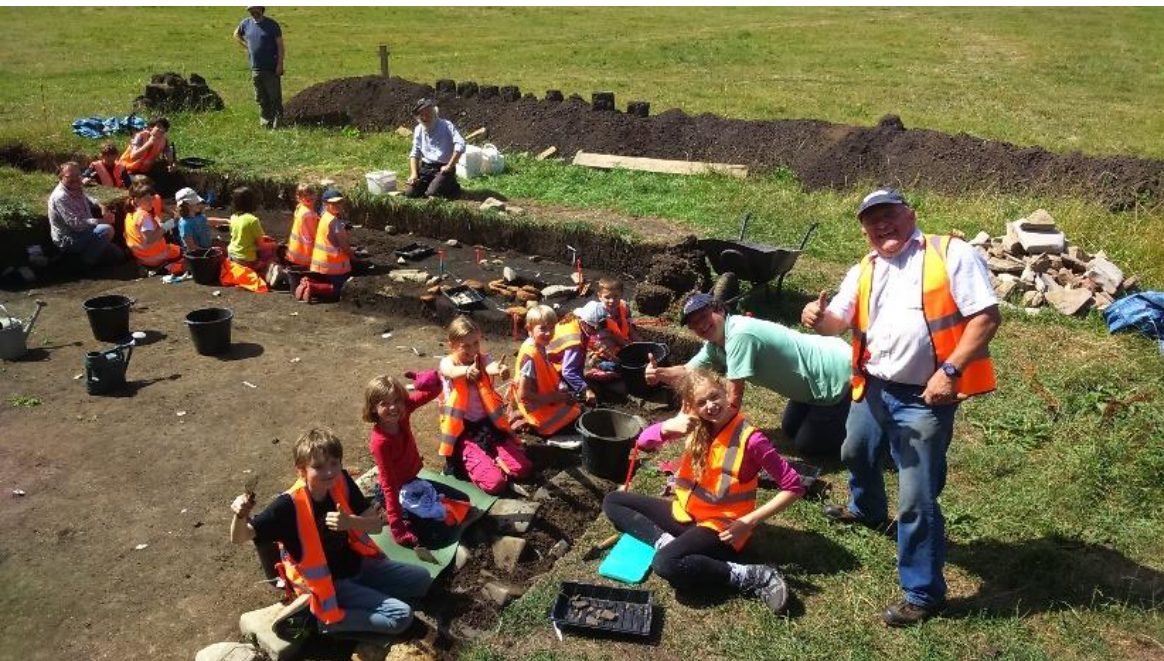
Can you dig it?!