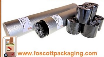
Pre-inked rolls Rol2