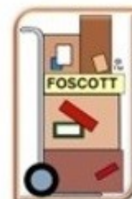
Carton Taping Machine Marking